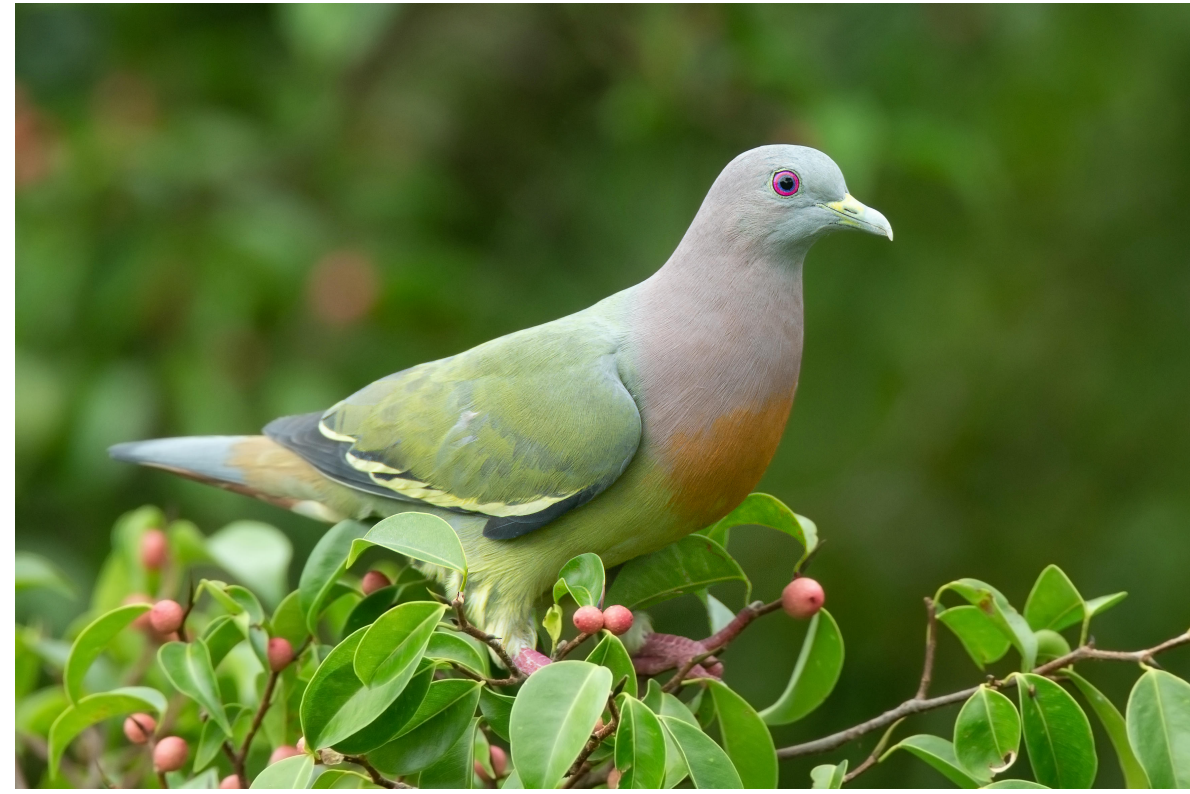
Figure 1: Pink-necked green pigeon [2].

'Columbidae is a bird family consisting of doves and pigeons. It is the only family in the order Columbiformes.' [1]