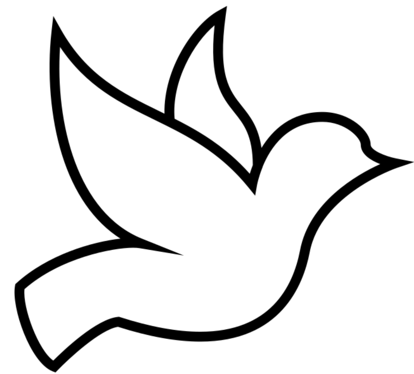
Figure 3: 'Doves [...] are used in many settings as symbols of peace, freedom or love. Doves appear in the symbolism of Judaism, Christianity, Islam and paganism, and of both military and pacifist groups.' [4].